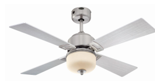
Reversible White Larch Finish Blades